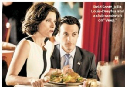
Reid Scott, Julia Louis-Dreyfus and a club sandwich on "Veep."

He's so convincing as the take-no-prisoners, career-climbing weasel Dan Egan, one might suspect he's just