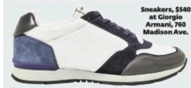
Sneakers, $540 at Giorgio Armani , 760 Madison Ave.